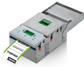
915AH030700700 PRINTER KPM180H-LL UHF RFIDCUT PRES ETH USB RS232 AVIATION

Via Berettine, 2 - 43010 Fontevivo PR - VAT: IT02498250345 - TEL: +39 0521 680111 - FAX: +39 0521 610701 - UNIQUE CODE: 8RQN7AZ