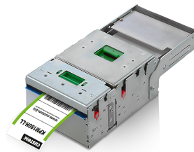
915AH021000700 PRINTER KPM180H RFID UHF ETH USB RS232 CUT AVIATION